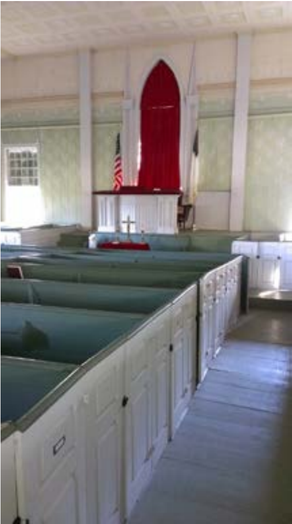
The Sanctuary of the Church