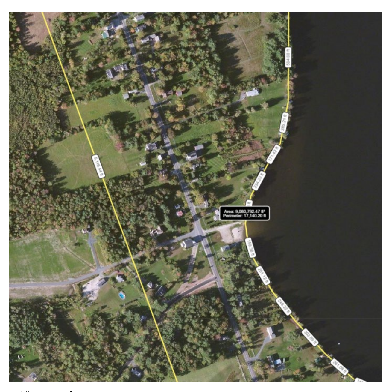
Middle portion of Historic District