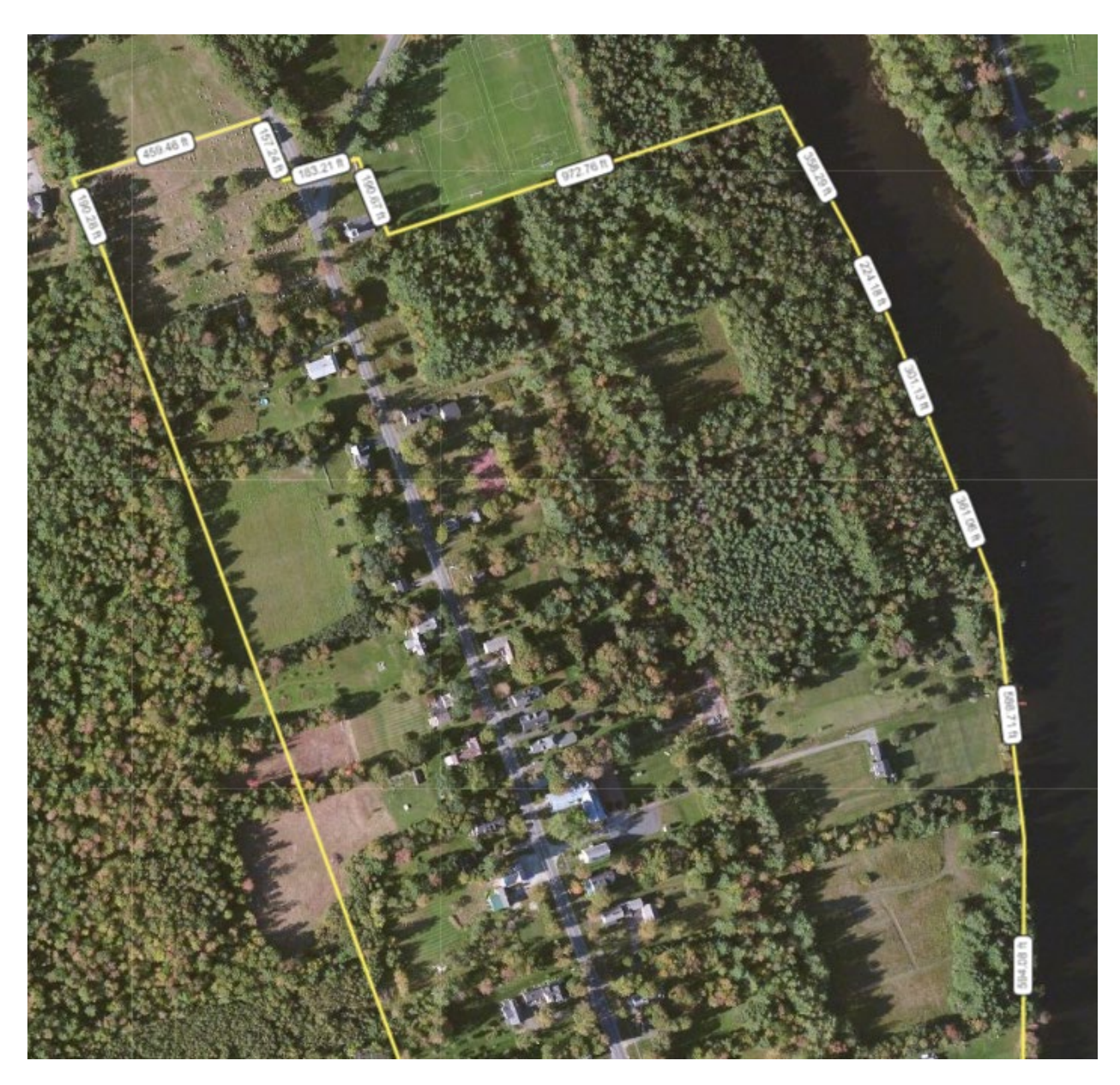
North end of Historic District