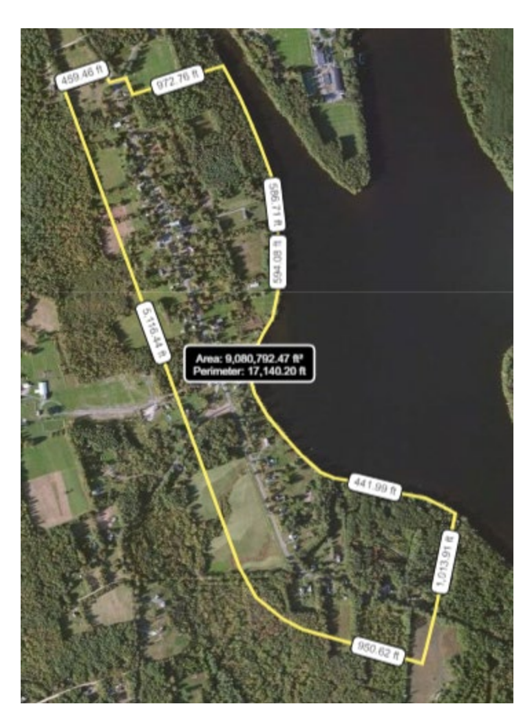
Complete district view