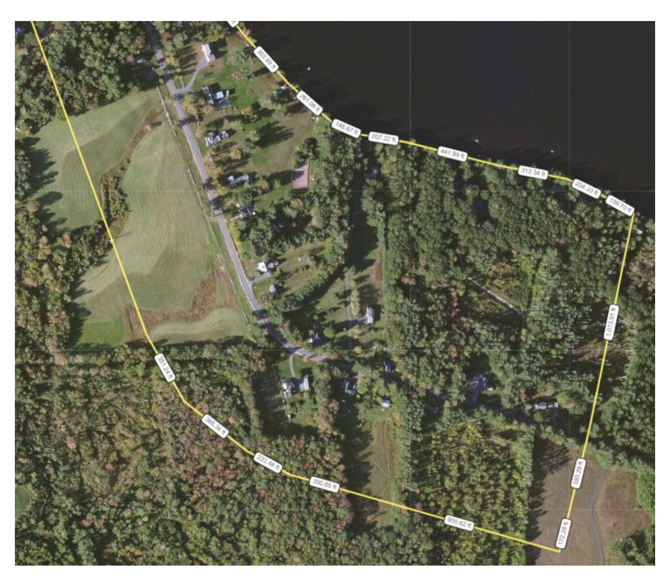
South end of Historic District