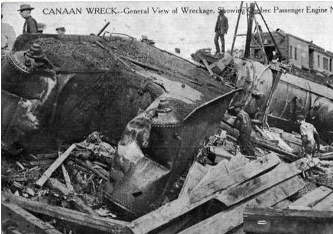
"General View of Wreckage Showing Quebec Passenger Engine No. 780"

The Canaan Train Wreck of 1907 Postcards made at the time of the crash September 15, 1907