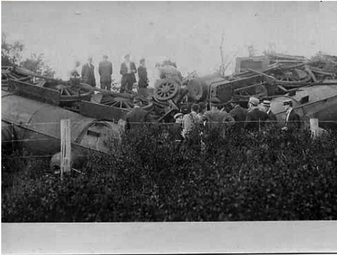
The Two Engines

The passenger engine coming from Quebec is on the left. Boston & Maine's freight is on the right.